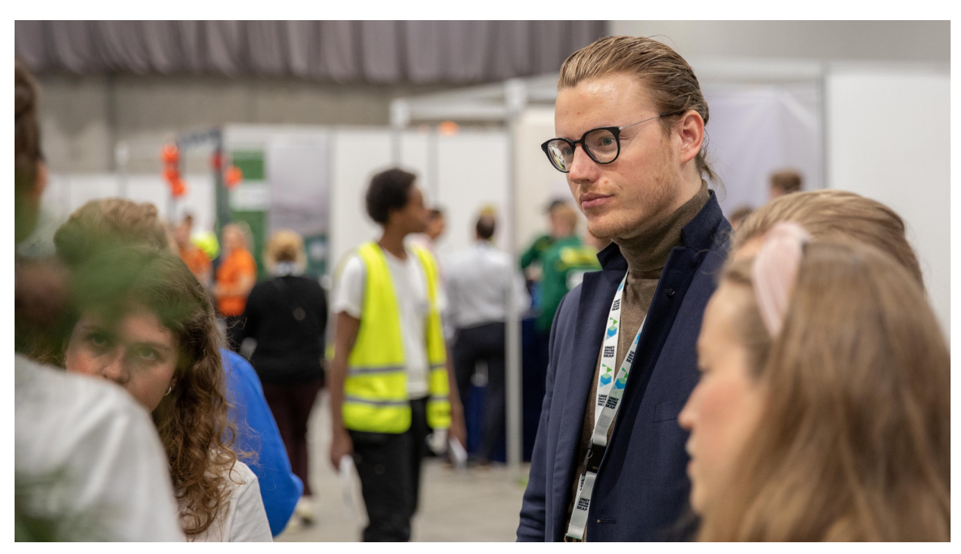
Our Nordic Head of Sustainability during the finals in Young Entrepreneurship, where he was in the jury for the sustainability prize

The program is a collaboration between Storebrand and the non-profit organisation Catalysts. The objective is to prevent students from dropping out of high school through inclusion in the local community.