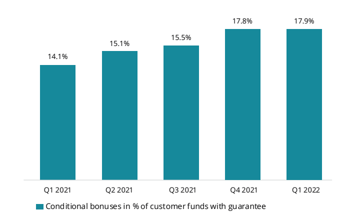
SPP Customer buffers

The buffer capital, conditional bonuses, amounted to SEK 13.6bn (SEK 11.9bn) at the end of the 1st quarter.